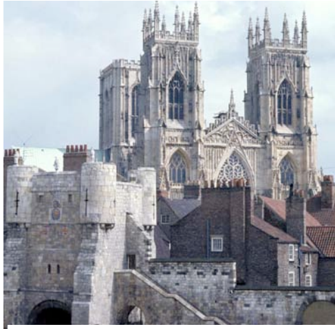
The York Minster today rising above the medieval walls.