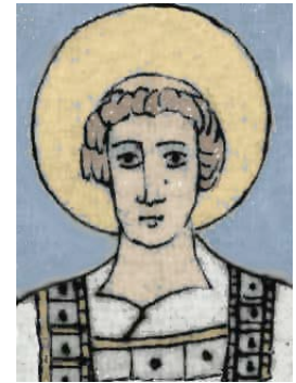
Top: An early image of Alcuin. Below Left: Supposed bust of Charlemagne.

The Prayer Book gives Alcuin the title of saint, and although there was no process of canonization in Alcuin's time, he had a reputation for holiness.. He was first and foremost an educator, and there are some who will say that to be a good educator it helps to be a saint. In addition to being an educator, Alcuin was a Yorkshireman, a title in which he took great pride.